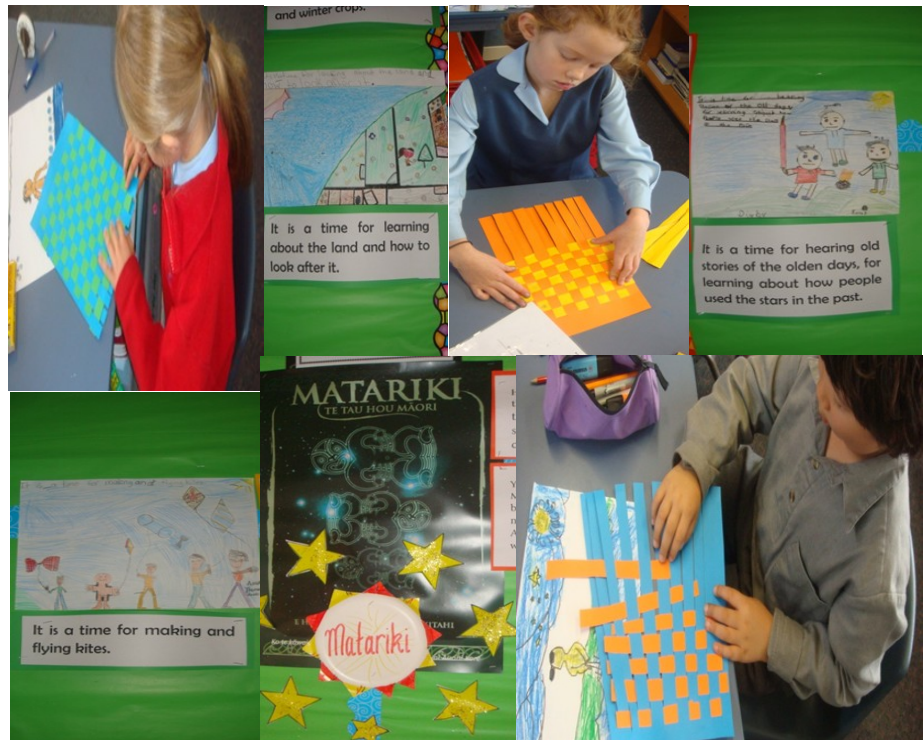
May the gentle light of Matariki guide and inspire us all this year. Amen

We worked in groups to make posters of Matariki and also did some paper weaving. Our work is displayed outside our classroom.