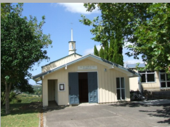
Class Masses are Wednesday mornings at 9.15am - everyone welcome!